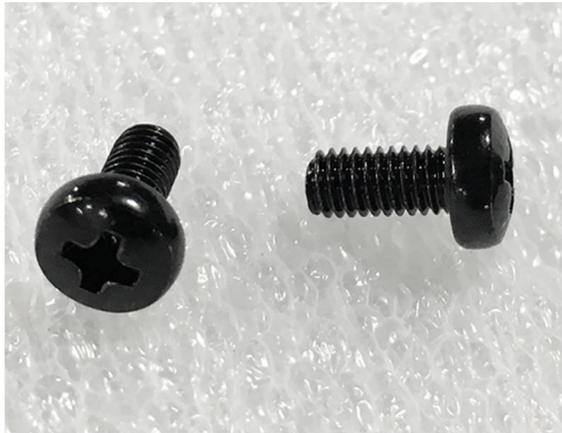
GREEN M3X6 PAN HEAD Securing PCIe Cards

The SM550/560 comes with a total of 3 different screws. For the purposes of this guide we will assign a unique color to each of the screw to signify their locations in this guide.