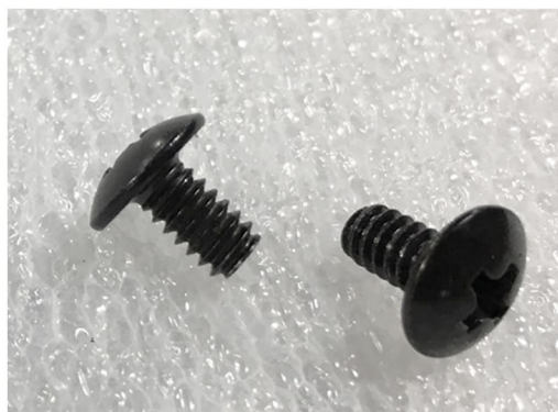
VIOLET M3.5 TRUSS HEAD Motherboard Power Supplies