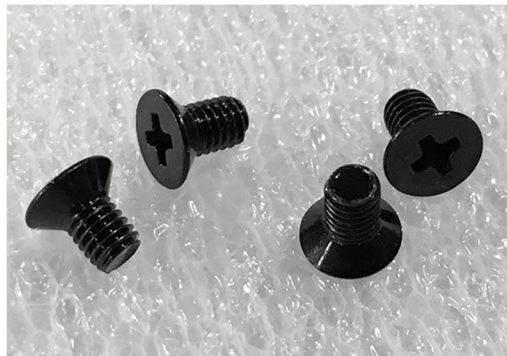
RED M3 x 5mm FLAT HEAD Chassis Top Assembly Rear AC Inlet SSDs (on SSD bracket)